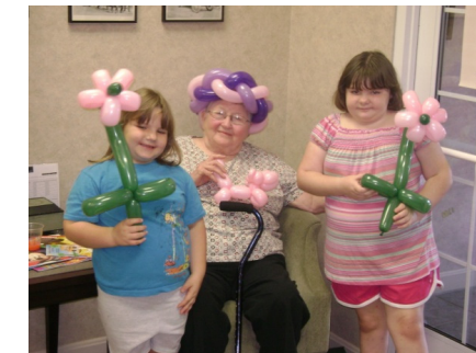
Snacks & door prizes were provided and here are three guests showing off their balloon creations.